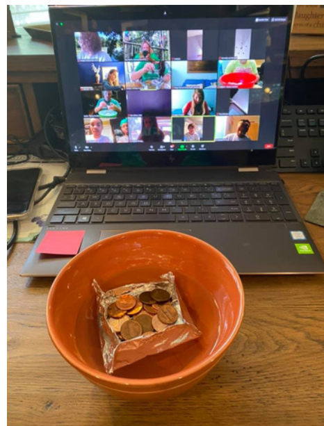
Teen Camp 2020 was different and full of firsts, but our kids still had a good time connecting and learning about living with Bleeding Disorders.