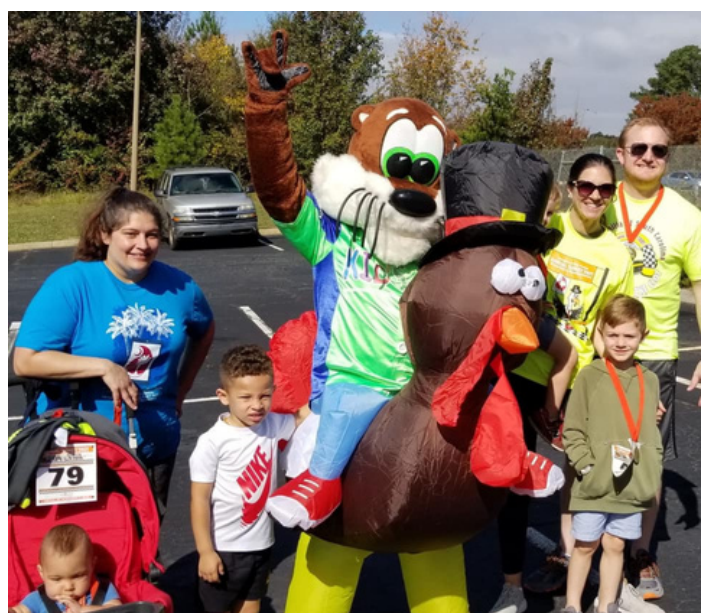
Our Turkey Trot walk is an opportunity for the community to come together and raise awareness of Bleeding Disorders to the public at large.